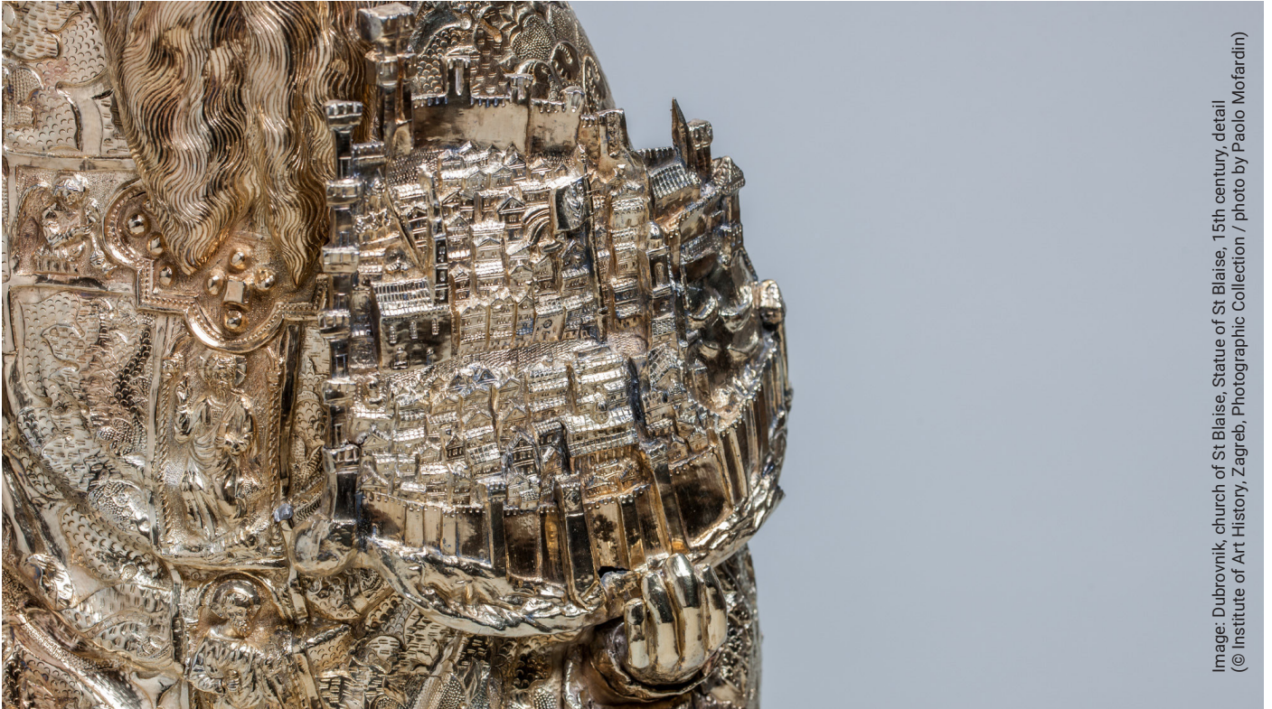
Image: Dubrovnik, church of St Blaise, Statue of St Blaise, 15th century, detail